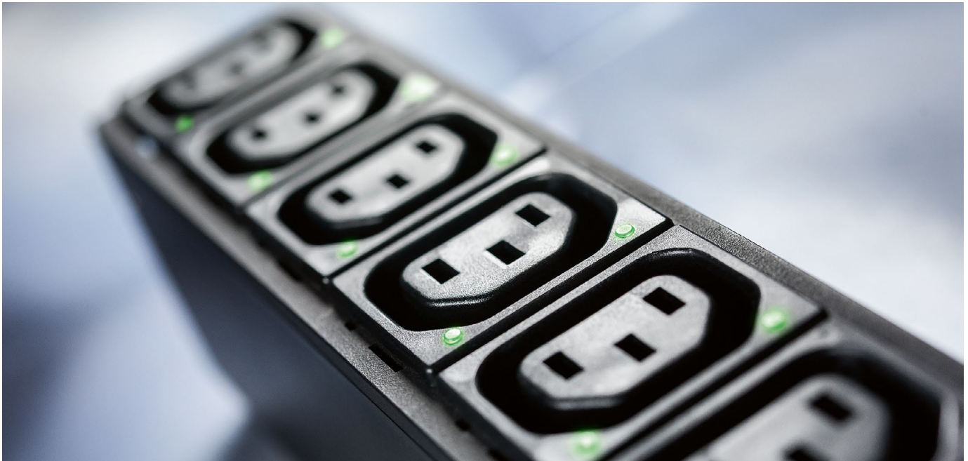
Power Distribution Unit (PDU) with integrated light pipes

In addition to 1-phase systems, 3-phase systems are also used in many places in industry and commerce. They often offer decisive advantages. It is important to ensure safe load balancing in order to prevent overloads.