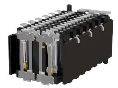
Figure 1: A cross-section of the Zero8 connector shows the gender-neutral contact system.

"Gender-free" PCB connector systems are already well-established on the market and offer an array of advantages. For example, production costs can be reduced when both sides of the connector system have identical geometries, while high-speed properties are improved by the use of a single contact point. However, ept's decision to develop this type of connector system is based on more than just these two advantages.