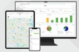
Manage this device with Digi Remote Manager