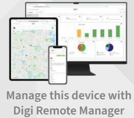
Manage this device with Digi Remote Manager