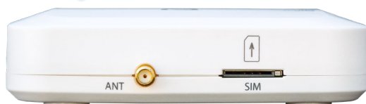
DIGI CONNECT® IT MINI LEFT