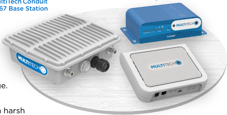
MultiTech Conduit® AP Access Point