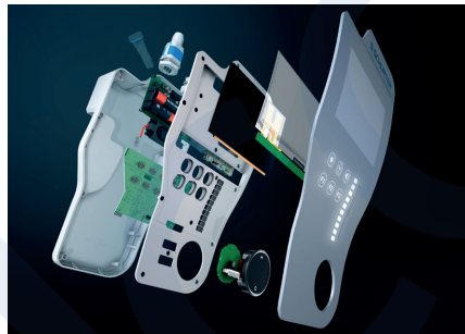
Construction of an HMI PCAP input system

With targeted advice, knowledge and creativity, we are your system partner for trendsetting, qualified HMI solutions.