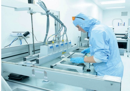
Optical Bonding of displays

Optical bonding is the optimal solution for applications with high requirements and challenging fields of application.