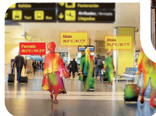
v Public Surveillance