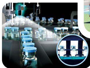
v Smart Manufacturing