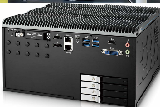
^ Robotic Control