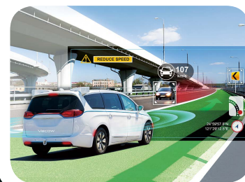
^ In-vehicle Computing