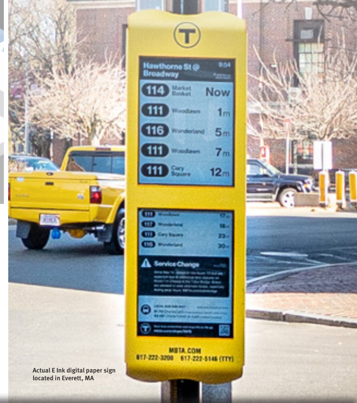
Actual E Ink digital paper sign located in Everett, MA

Alcom electronics | Singel 3 | B-2550 Kontich | Belgium | Tel. +32 (0)3 458 30 33 | info@alcom.be | www.alcom.be Rivium 1e straat 52 | 2909 LE Capelle aan den IJssel | The Netherlands | Tel. +31 (0)10 288 25 00 | info@alcom.nl | www.alcom.nl