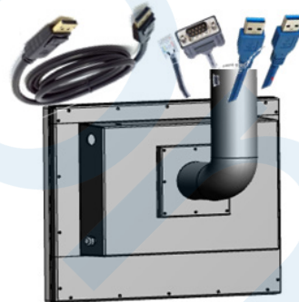
Stainless steel housing for full IP65/IP69K

Water and dust proof is easy and reliable with standard cable connectors. No extra cost needed.