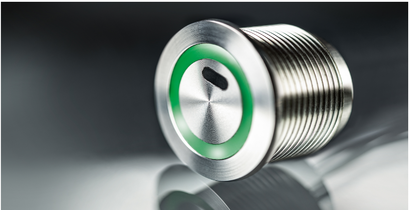
SCHURTER TTS: high-precision, touchless Metal Line switch in optical ToF technology (Time of Flight)

Please, do not touch! Because that doesn't have to be the case at all. A new generation of switches for touchless switching has been developed for exactly this purpose. Switching without touching. Switching without contaminating the surface with potentially harmful germs, viruses or bacteria. How do these switches work and what are they capable of?