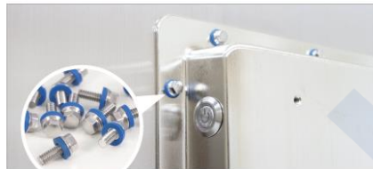
Special FDA-grade Hygienic Bolts