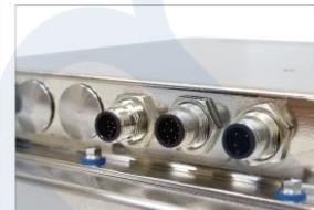
Waterproof M12 Connectors