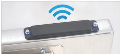
Embedded Wireless Antenna & Waterproof Cover

To make it through all the hygienic cleaning in food automation, PhanTAM-8B is total IP66/IP69K-rated to resist high pressure and high temperature water jet. It comes with waterproof cover for wireless antenna to prevent water ingress and bend damage. Besides, with M12 connectors and hygienic bolts, it attains seamless design with integral molding. Moreover, the hygienic bolts are FDA-certified! Combining anti-bacteria, anti-corrosion, anti-oxidation, wide range temperature resistance from -20°C~60°C (for option) and more features, PhanTAM-8B is easy to clean and is well suited for applications like food & beverage, clean room, pharmaceutical factory, etc.