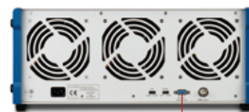
Remote Monitoring Port

The PXIS-2719A has a built-in control board monitors and manages chassis status, including internal temperature, fan speed, and voltages. Using the RS-232 monitoring port, the chassis status information can be exported to another computer for remote management. The control board can also accept commands from the remote system to allow remote power on/off and fan speed control of the PXIS-2719A chassis.