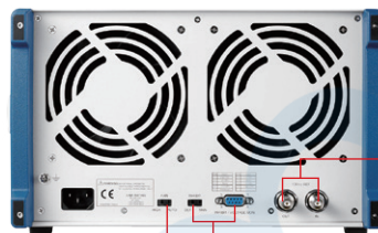
PXES-2590 Back View