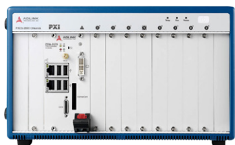
PXES-2590 Front View