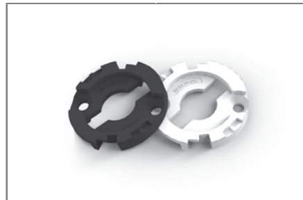
D24 COB HOLDER

Pin to Pin with BJB solderless holder, Same outer dimensions, Same screw positioning, Same buckle position; Pin to Pin with other ZHAGA standard holder.