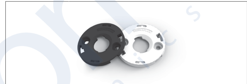
D35 COB HOLDER