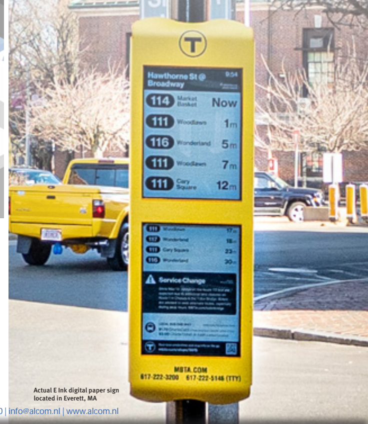
Actual E Ink digital paper sign located in Everett, MA

Contact E Ink to Learn More | eink.com/transportation