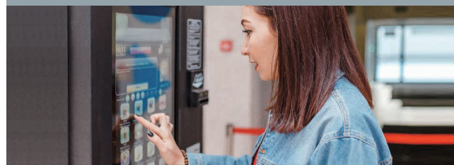
Intelligent Transportation System (ITS)