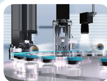
^ Auto Optical Inspection