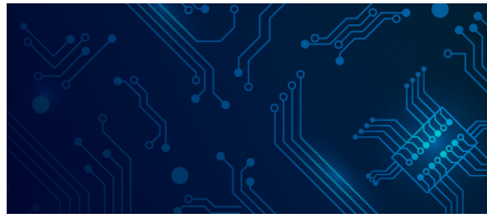
Customized Power Solutions