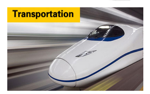
Aquam8628/8128 24+4G M12 Port Layer 3/2 Managed EN50155