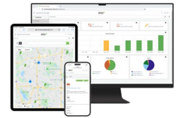
Manage and configure Digi IX40 with Digi Remote Manager