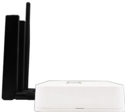
Digi HX15 Gateway for LoRaWAN — left