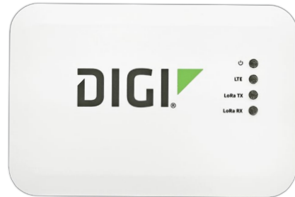
Digi HX15 Gateway for LoRaWAN — back