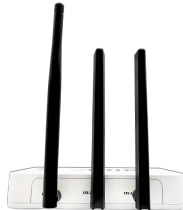
Digi HX15 Gateway for LoRaWAN — back