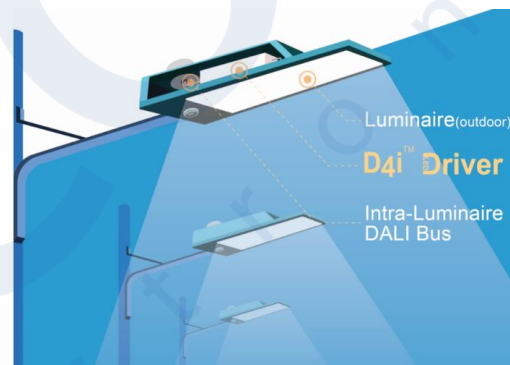
Figure 2: Intra-Luminaire Applications: DALI-2 bus does not leave the luminaire