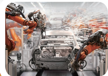
▲ Robotic Control