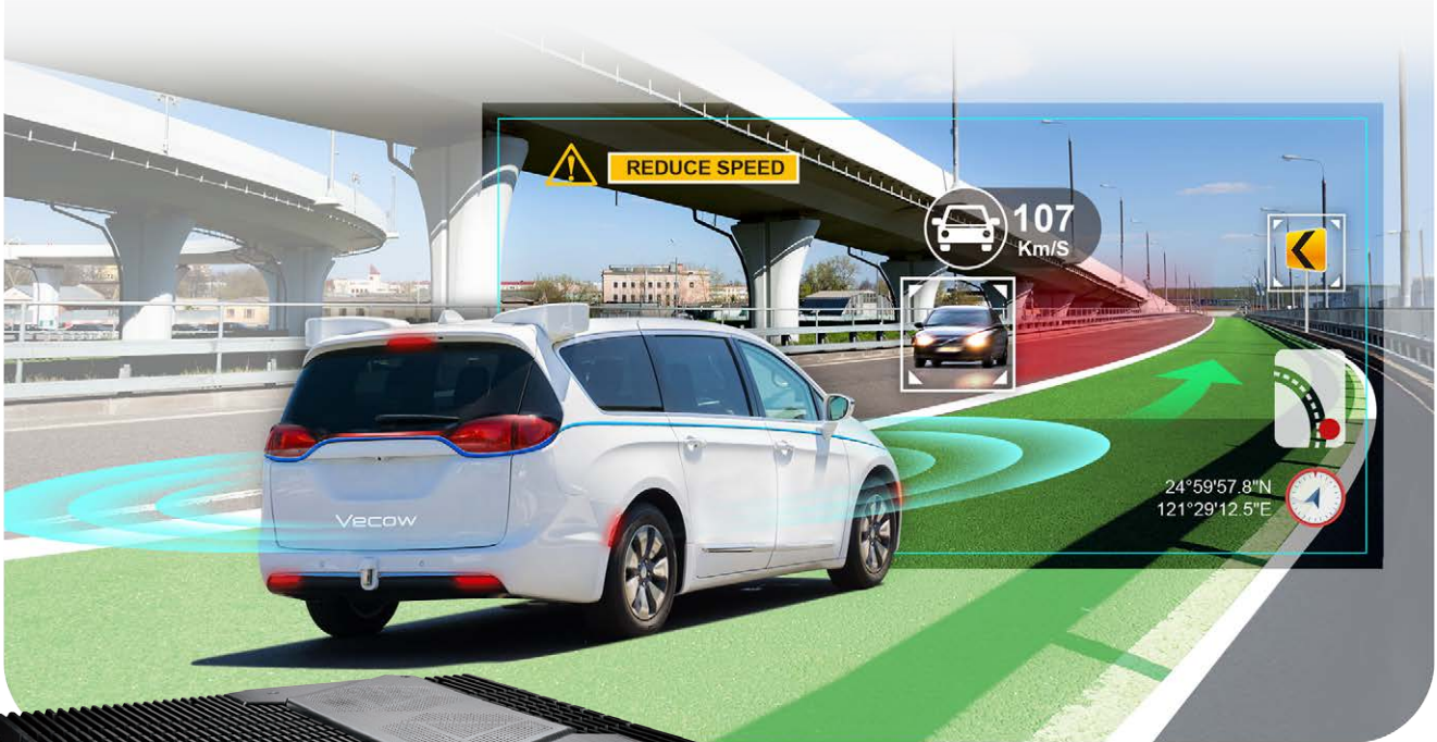
▲ Traffic Vision

AI Computing System with NVIDIA® Tesla®/Quadro®/GeForce® Graphics